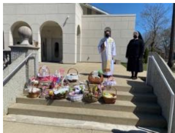
Easter Food Basket Blessing , April 3, 2021